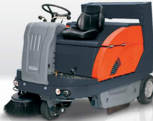
Sweepmaster P1200 RH