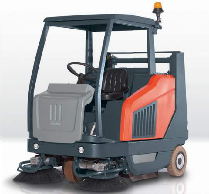
Sweepmaster P1500 RH with optional cab safety roof