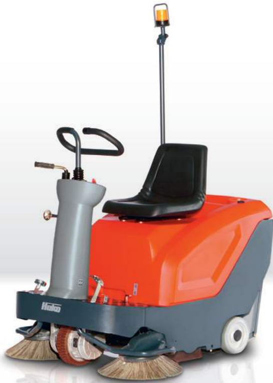
Sweepmaster B800 R