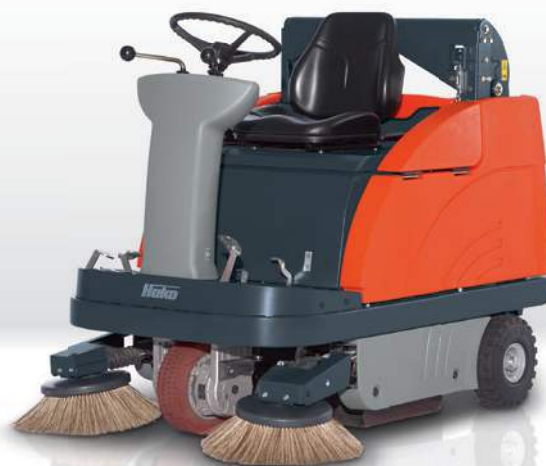
Sweepmaster B980 RH