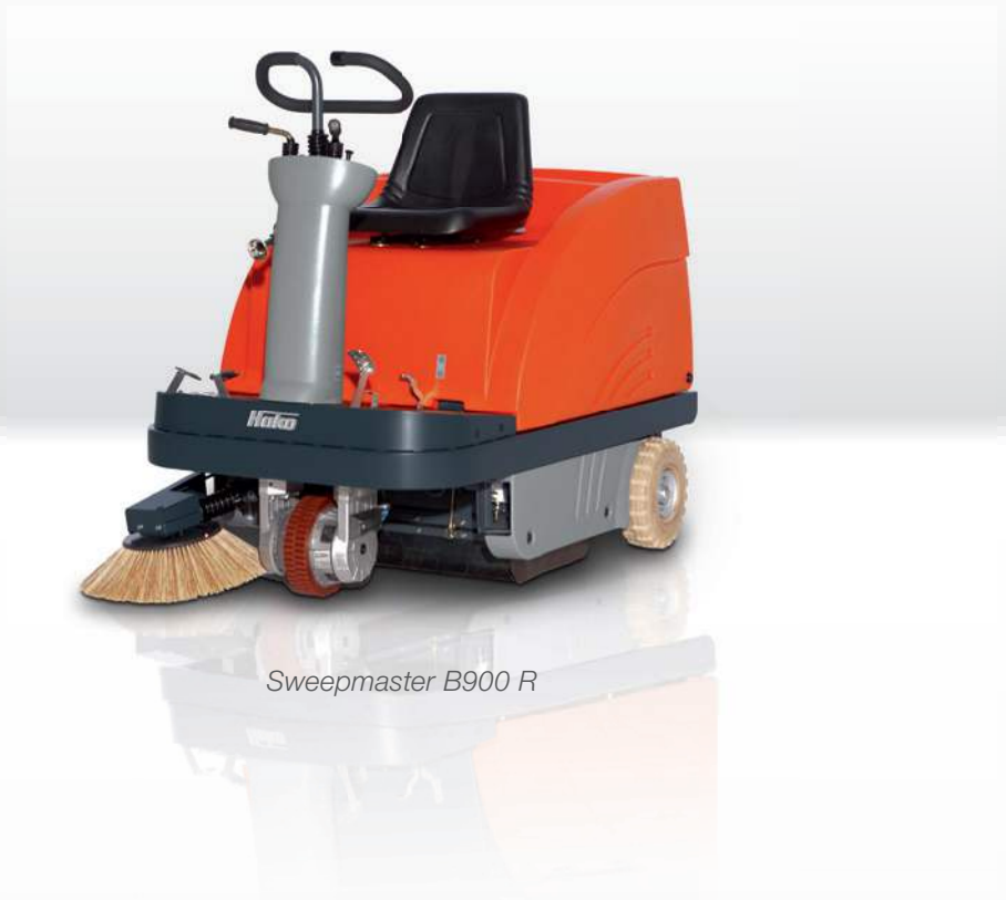
Sweepmaster B900 R