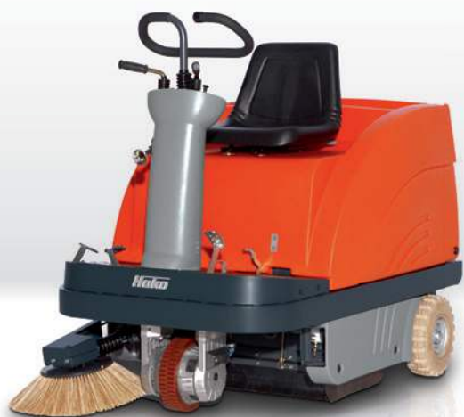
Sweepmaster B900 R