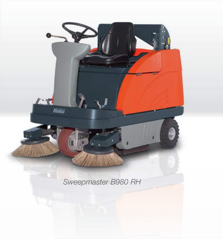
Sweepmaster B980 RH